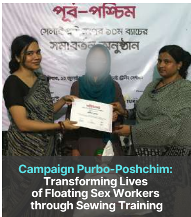
Campaign Purbo-Poshchim: Transforming Lives of Floating Sex Workers through Sewing Training