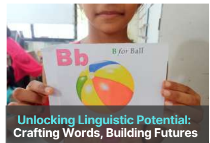
Unlocking Linguistic Potential: Crafting Words, Building Futures