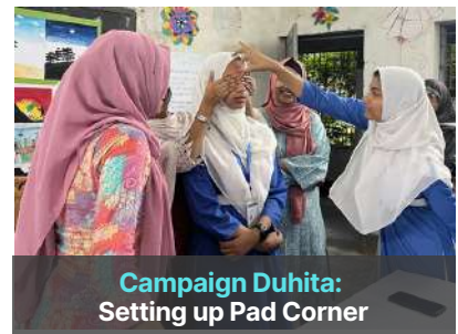
Campaign Duhita: Setting up Pad Corner