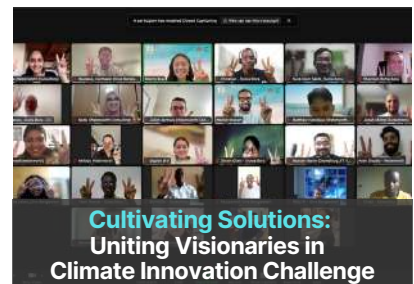
Cultivating Solutions: Uniting Visionaries in Climate Innovation Challenge