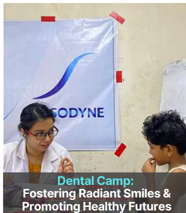
Dental Camp: Fostering Radiant Smiles & Promoting Healthy Futures