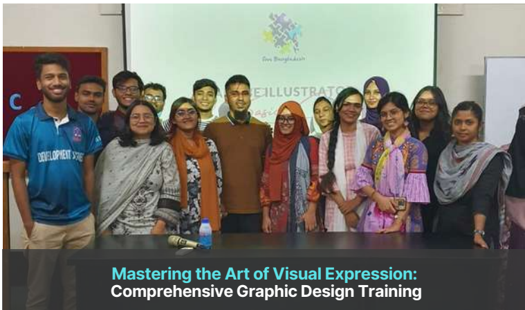
Mastering the Art of Visual Expression: Comprehensive Graphic Design Training